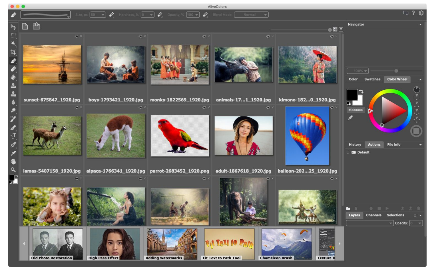
Figure 3. When you reopen AliveColors, a list of the recently opened documents appears. These can be viewed either as thumbnails or as a text list. At the very bottom of the window is the (horizontally scrollable) Learn Panel where you can find links to video tutorials for AliveColors. Bothe of these options can be turned off if you want a cleaner/uncluttered look for your AliveColors window.