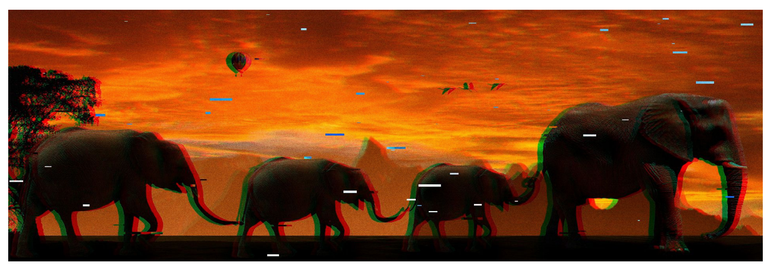
Figure 4. The new Glitch art effect adds digital noise and distortions to your photos or images. The color shift option has a look not unlike what a 3D image would look like before wearing the blue and cyan Anaglyph 3D cardboard glasses.