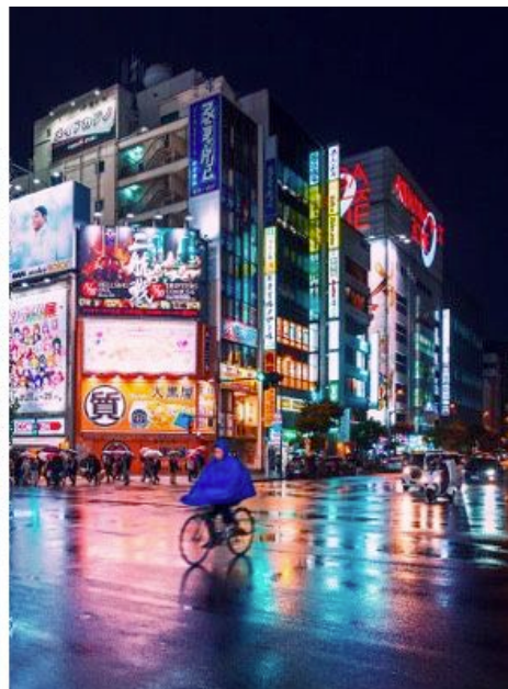
Figure 6. The new Splatter effect modifies the look of your photo using splatters, splashes and blots of paint (left part of the image - this makes it look like you are looking through a rainy windshield).