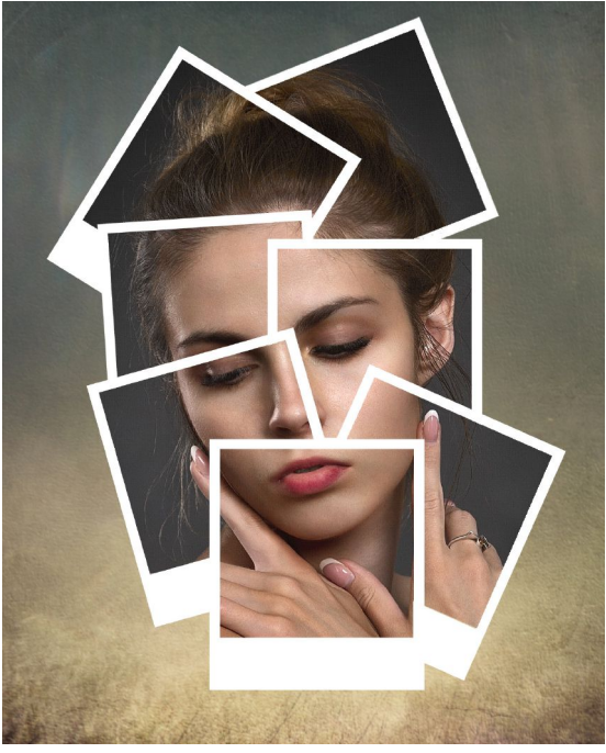
Figure 2. AliveColors helps you unleash your creative ideas like making this Polaroid Photo Collage.

In a test, I picked an area from the middle of a pink and white Dahlia and then cloned from the green grassy area next to the flower. The flower turned to shades of green - match-